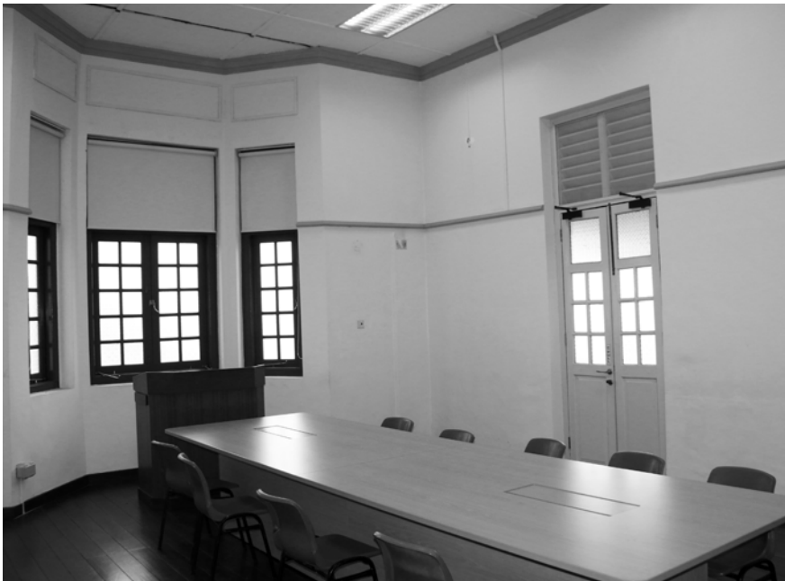
▲ New Conference Room at Beulah House