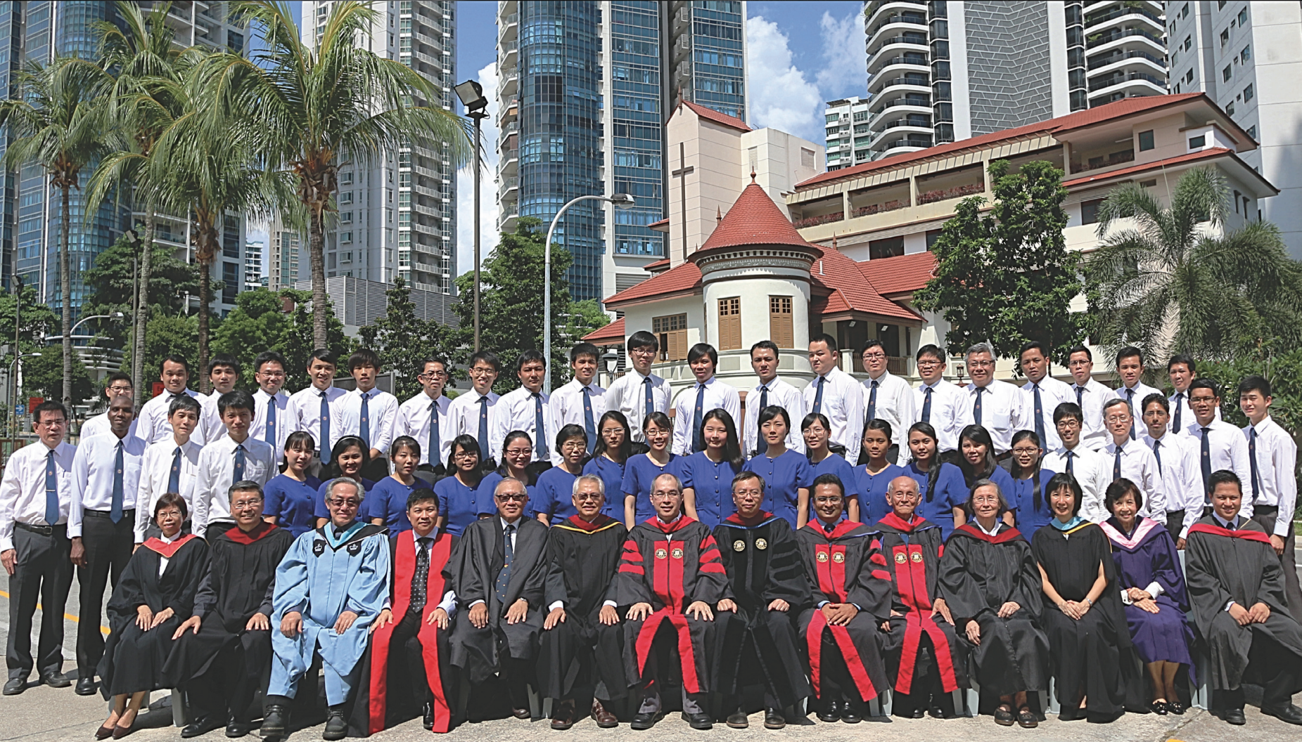
FAR EASTERN BIBLE COLLEGE Board, Faculty, Students 2015 Background: Beulah House, 10 Gilstead Road