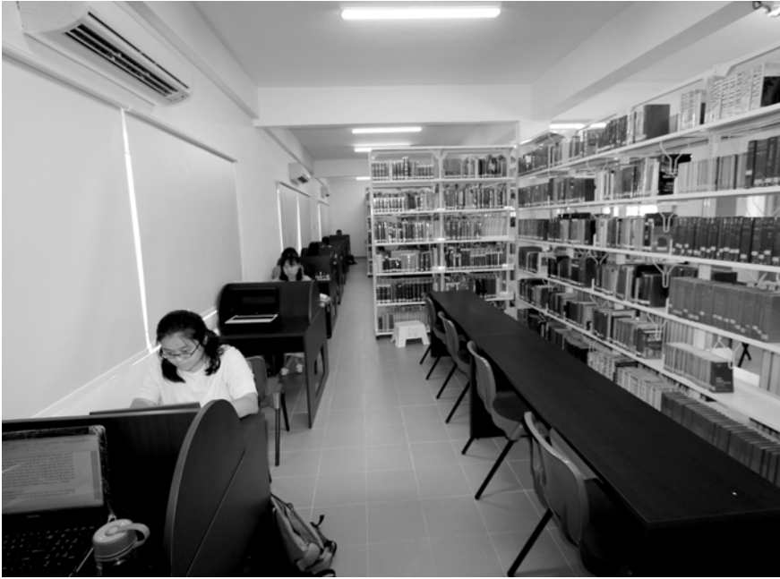
▲ View of Main Library with Study Carrels (L-block, 2nd storey, 9A Gilstead Road)