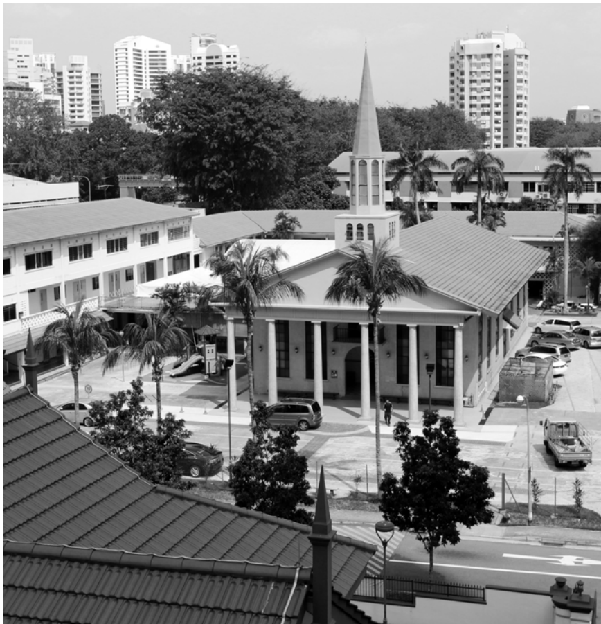
▲ 9A Gilstead Road taken from 10 Gilstead Road, New Beulah Centre

Here’s a pictorial glimpse of the college campus and facilities