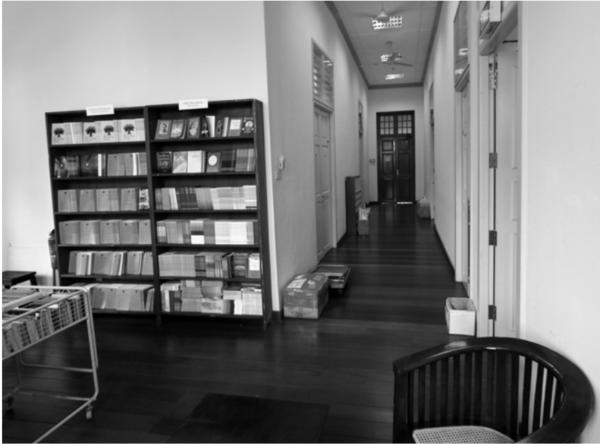
▲ View of 2 nd Storey inside Beulah House