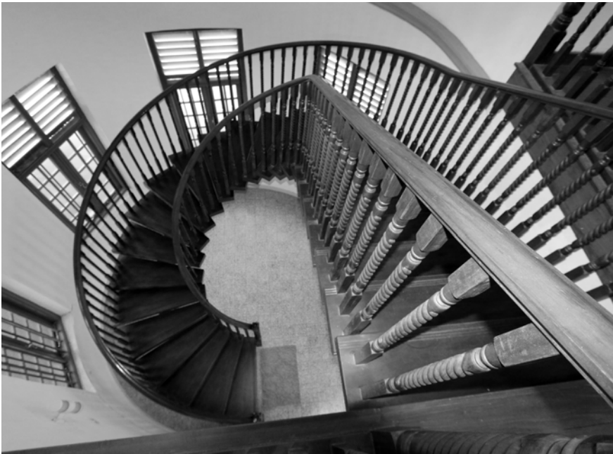
▲ Spiral Staircase to 2 nd Storey of Beulah House