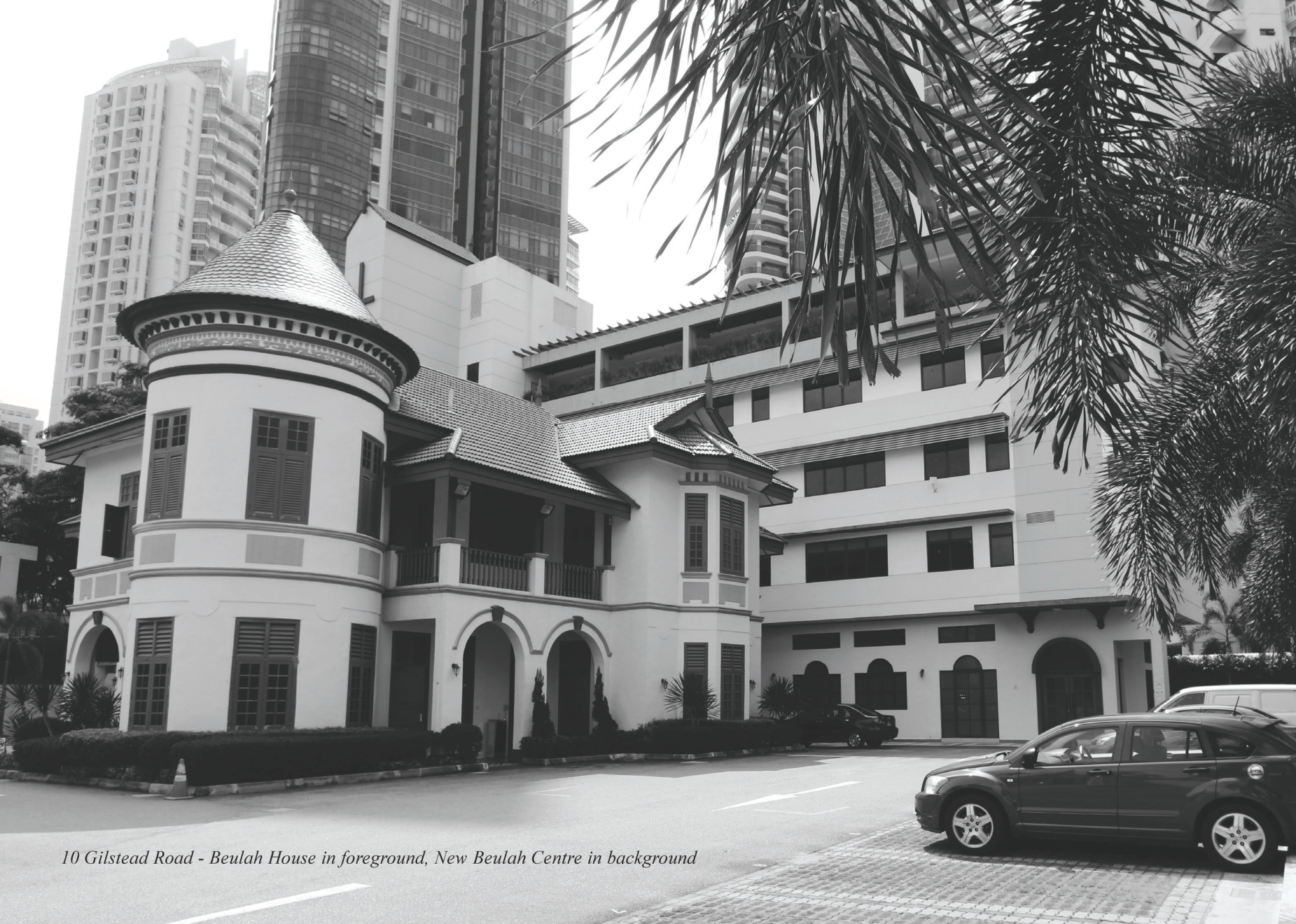
10 Gilstead Road - Beulah House in foreground, New Beulah Centre in background