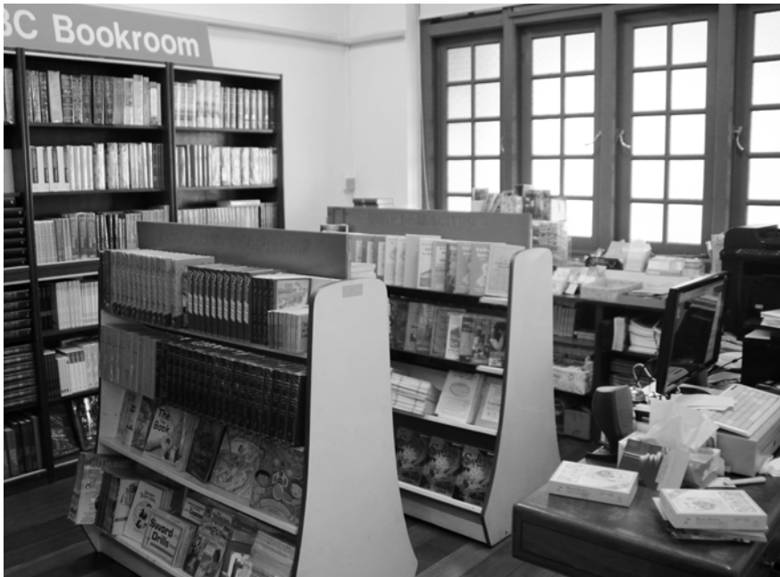
▲ New FEBC Bookroom at Beulah House