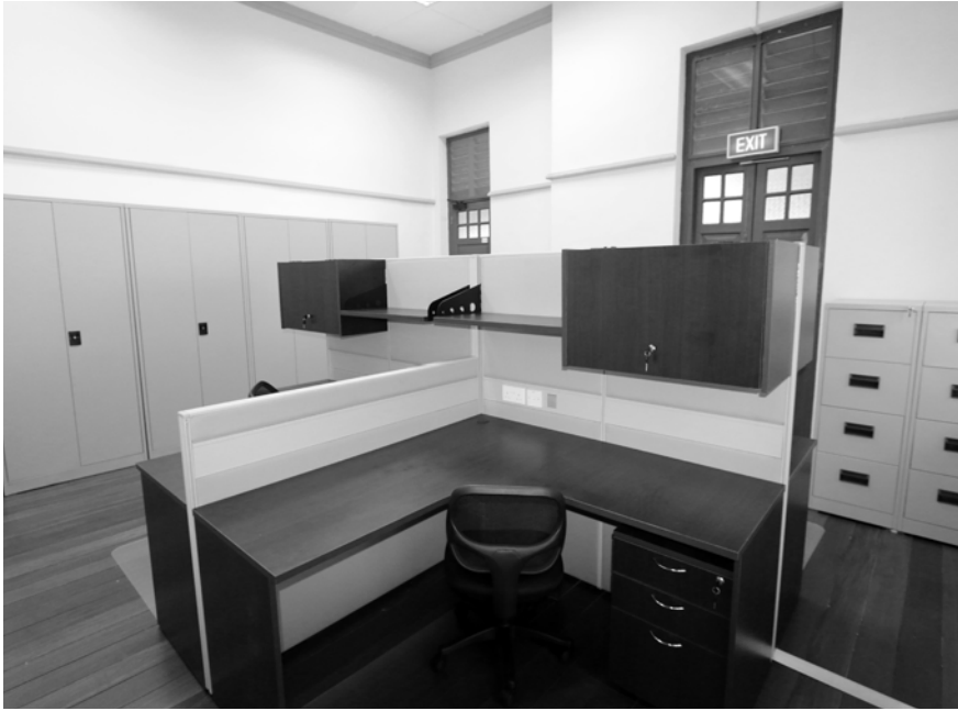
▲ New FEBC Staff Room at Beulah House