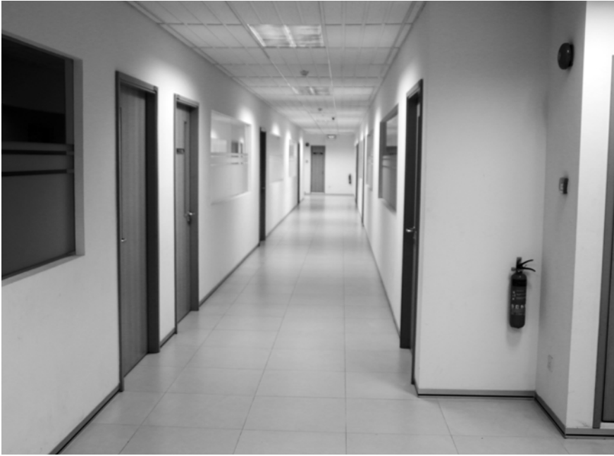
▲ 4 th Storey Corridor to Classrooms at New Beulah Centre