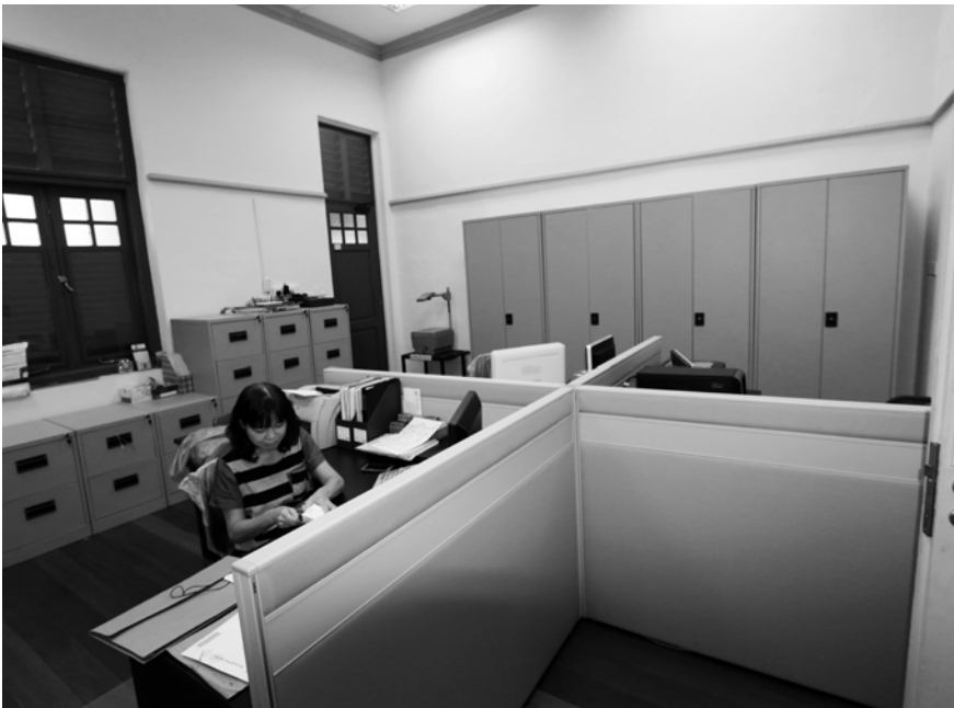
▲ New FEBC Office at Beulah House