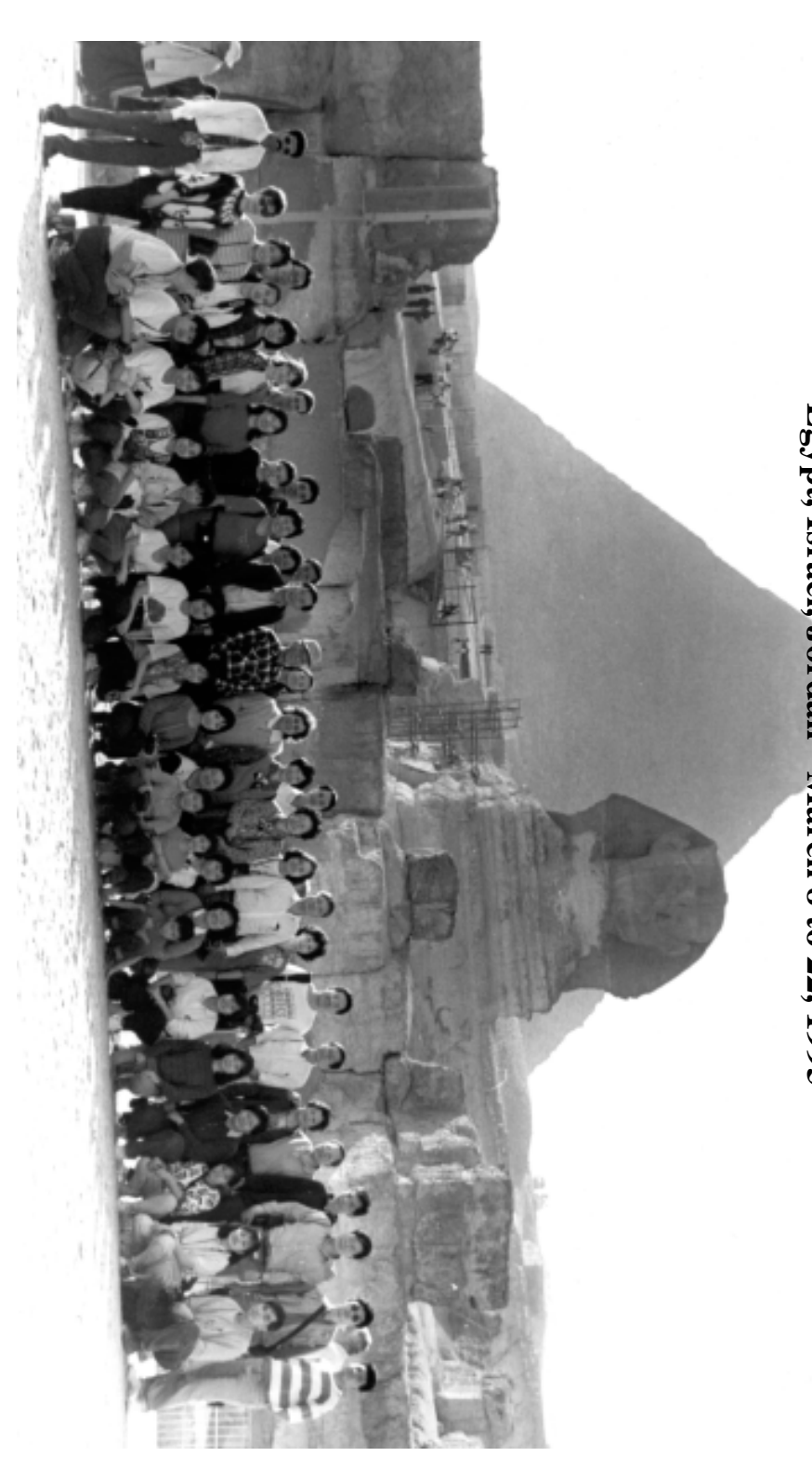
FEBC-LIFE 6TH HOLY LAND PILGRIMAGE Egypt, Israel, Jordan - March 8 to 22, 1995